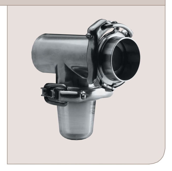
Fig. 1. LKBV, Airblow valve